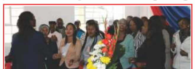
The Rustenburg Campus Choir was also acknowledged for representing the College at the COSACSA Arts & Culture National Festival in Richards Bay in 2017.

A special thanks to all staff members who were involved and who assisted in making the celebration the success that it was.