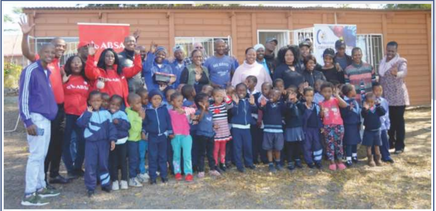
Teams ORBIT and ABSA celebrating with JD Mosiah Primary School's Management team & School Governing Body (SGB) members and Grade R learners, after the donation of tables, chairs and chair bags for the little one's classes

In the spirit of giving back and making a difference in our communities, ORBIT College in partnership with ABSA, handed over 18 brand new kiddies tables, 72 chairs and chair bags to JD Mosiah Primary School in Tlhabane on 1 June 2018. The project, which was rolled out from February 2018, saw the school's two Grade R classes being renovated to improve the poor infrastructure, which was not conducive for teaching and learning.