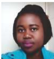
Ramodisa SE OA Level 4 Mankwe campus