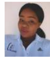
Mokgosi BV Tourism L4 Mankwe Campus