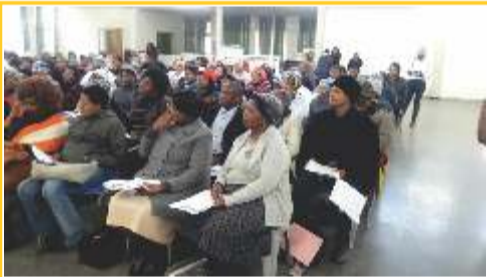
Participants in the programme are briefed of what is expected of them during the 12 month training period

The practitioners, currently volunteering at Early Childhood Development Learning Centres but with no formal ECD qualifications, have been selected to take part in a 12 month ECD Training Programme, which will see them acquire ECD Level 4 Certificates and become qualified ECD Practitioners upon completion, as per the