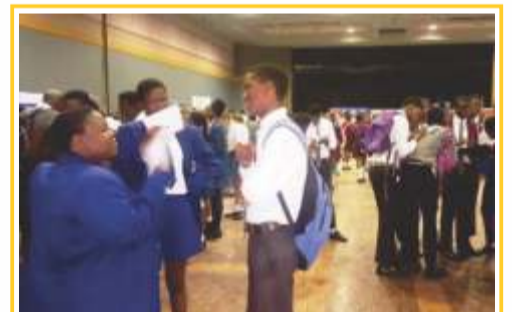
Grade 12 learners of Secondary Schools in Rustenburg and Moses Kotane Sub-Districts enjoying their edutainment outing at CEIA Bojanala Career Expo

The College was also well represented at the DHET Career Exhibition that was hosted at Limpopo in Mokgoophong Village on 23 April 2018.