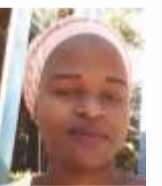
Medupe KE OA L4 Rustenburg Campus