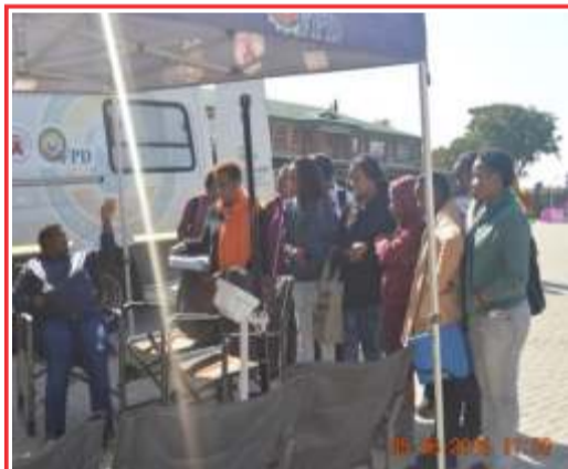
Students and staff queued to get tested for HIV/AIDS, TB and diabetic screening, and STIs. Family planning services were also offered for female students