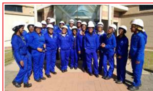
The EIC Level 4 students at the ESKOM Power Station in Vereeniging on 31 March 2018

Electrical Infrastructure & Construction (EIC) Level 4 students went on an excursion to the ESKOM Power Station in Vereeniging on 31 March 2018, learnt more about how electricity is transmitted from the power station to various distribution points.