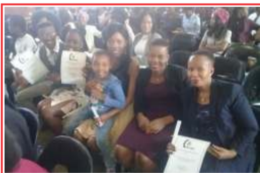
Some of the recipients (staff and students) of awards and certificates

The Campus Manager also took the opportunity to award some staff members for their commitment and hard work.