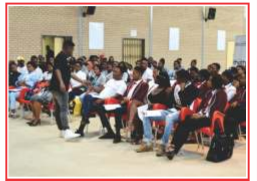
Presenter of the Daily Thetha Show, taking questions from students during the pre-recording of the show

Brits Campus hosted the Daily Thetha Show, a youth talk programme aired on SABC 1 from Monday to Friday, which focuses on current affairs and youth-related topics from a youth point of view on 19 March 2018. About hundred students from the three College campuses (Brits, Mankwe and Rustenburg) took part in robust dialogue discussions with one of the presenters of the show and a panel of experts, including College lecturing staff. The first discussion centred on the controversial topic "Does the education of the black youth benefit the black community?" followed by another engaging discussion under the topic: "Does the youth have an opportunity to exercise their freedom in small towns?"