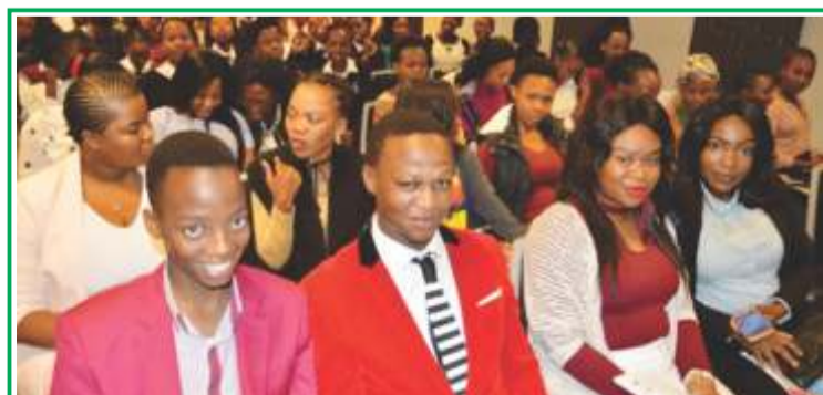
The venue was packed to capacity with girls and young women from the College, neighbouring high schools and communities, interested to find out more about the growing opportunities available for females in the ICT Sector

International Girls in ICT Day is an annual initiative supported by the International Telecommunications Union (ITU) Member States to create a global environment that empowers and encourages girls and young women to consider studies and careers in the ICT Sector.