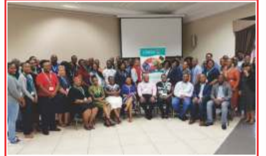
TVET College Lecturers who are currently enrolled for the Masters Research Project for TVET Colleges offered at UNISA