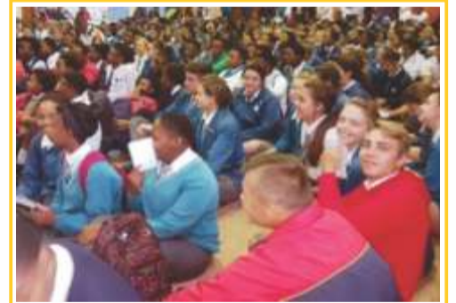
Royalty Annual Career Expo at Grenswag Hoërskool in progress

Anglo American Platinum Mine valued our presence at their Career Open Day that was hosted on 9 May 2018. This career day was limited to Tshukudu Secondary School learners in Thekwane Village.