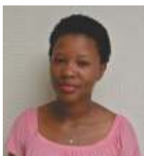
Goitirwang KR OA Level 4 Rustenburg Campus