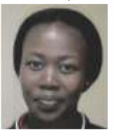
Monareng TR Trans & Logistics L4 Mankwe Campus