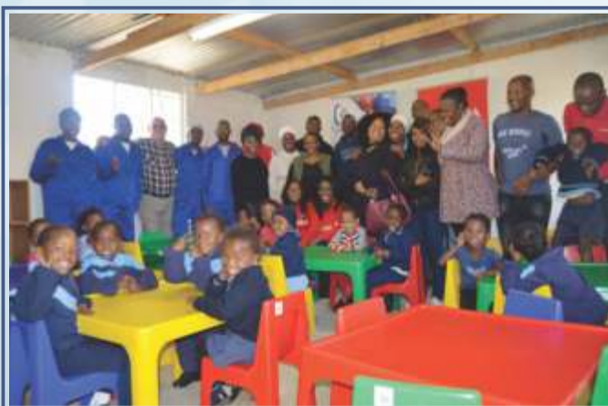
The excited Grade R learners, teachers, ORBIT College and ABSA representatives in the newly renovated classroom