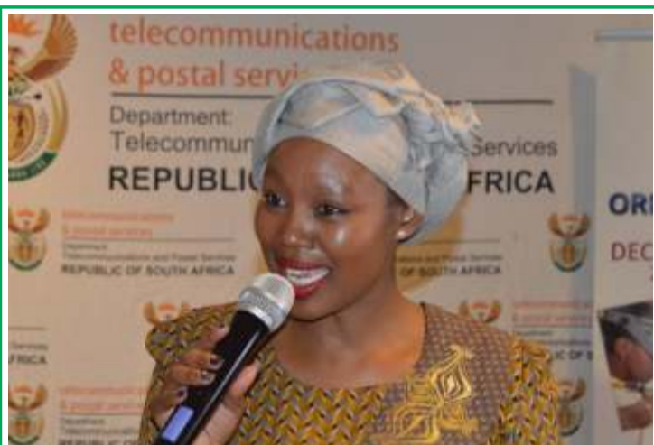
Deputy Minister of Telecommunications and Postal Services, Hon. Stella Ndabeni-Abrahams encouraged approximately 150 girls and young women to consider taking up careers in the growing field of Information and Communication Technologies (ICTs)

dominated, especially at senior levels. Various females and stakeholders making a mark in the ICT Sector, were invited to share their personal journeys with the learners on how they got to where they are today in the sector.