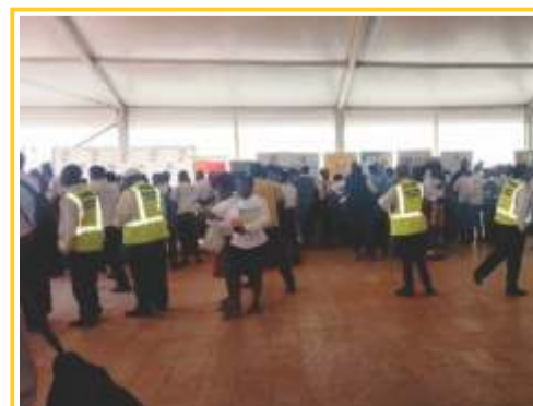
Career Expo at Mokgoophong Village Stadium in Limpopo