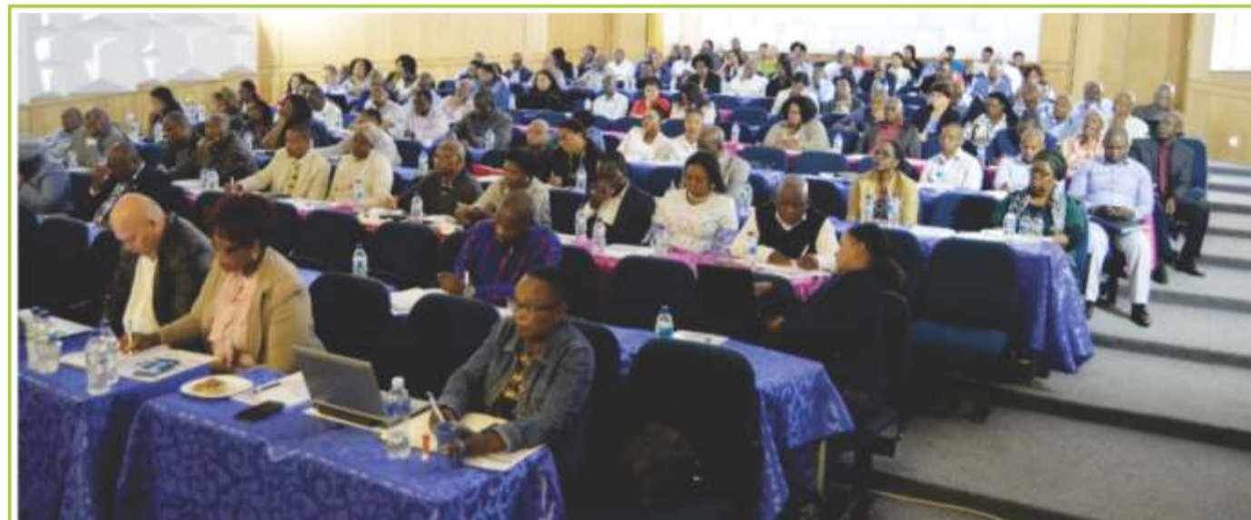
HR Practitioners from the Mpumalanga and North West TVET Colleges, attended the HR Workshop organised by the Department of Higher Education and Training

The North West & Mpumalanga Region is in the process of finalising the regional HR Forum to be launched before 31 May 2018