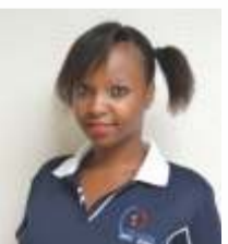
Monaise LM OA Level 4 Rustenburg Campus