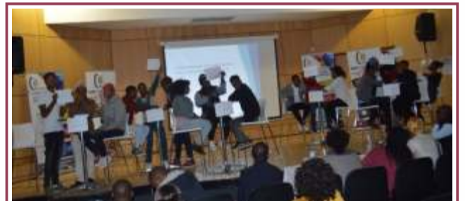
Participants in the Mandela Quiz Competition

Congratulations to all the winners at this year's College Academic Day. To all the students who participated in the various categories, the day was a success because of you and your participation. Keep up the spirit of wanting to learn and improve on your craft.