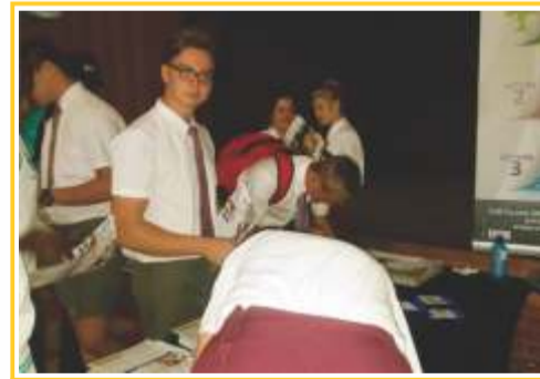
Grade 12 learners of Secondary Schools in Madibeng and Lethabile Sub-Districts showing interest at ORBIT stand during CEIA Madibeng Career Expo in Brits