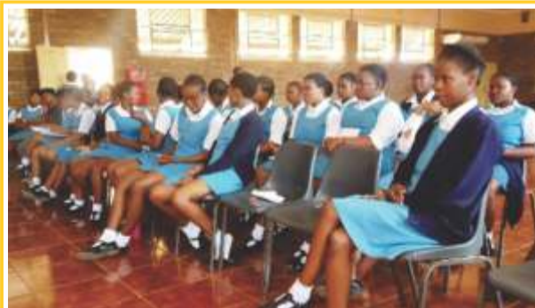
Grade 12 & 11 learners of St Annes Secondary School in Bapong 2 Village seated to receive presentation about study opportunities at ORBIT College

On an annual basis the team embarks on exciting recruitment drives such as school visits, career exhibitions, open days, stakeholder liaison sessions, etc. This year is no different and will be even better as we managed to reach out to nine secondary schools via school visits during the month of March alone. Schools visited were: New Covenant & Academy, Grenville High School, Kgosibodiba Secondary School, Motlhaputseng Secondary School, Thethe Secondary School, Rakoko Secondary School, St. Annes Secondary School, Sedibelo Secondary School and Gabonewe Secondary School.