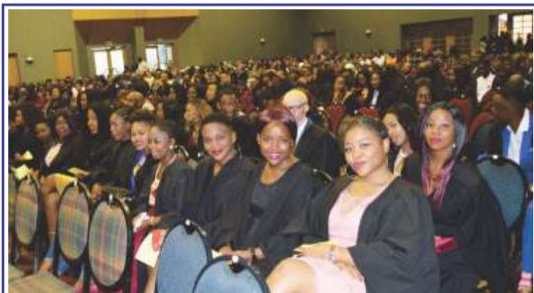
ORBIT College conferred a record-breaking 1027 graduates with National Certificates and National N Diplomas at its Annual Diploma & Certification Ceremony, on 24 May 2018 at the Rustenburg Civic Centre