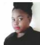
Sentsho NP OA Level 4 Mankwe Campus