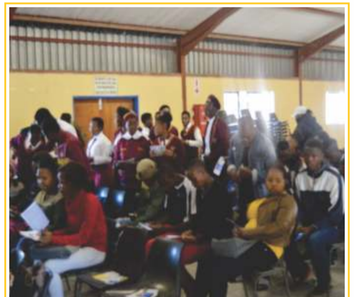
The learners from schools in Marikana and out-of-school youth at the Career Expo