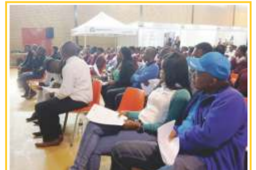
Career Open Day by Anglo American Platinum Mine at Tshukudu Secondary School in Thekwane Village

Anglo American Platinum Mine valued our presence at their Career Open Day that was hosted on 9 May 2018. This career day was limited to Tshukudu Secondary School learners in Thekwane Village.