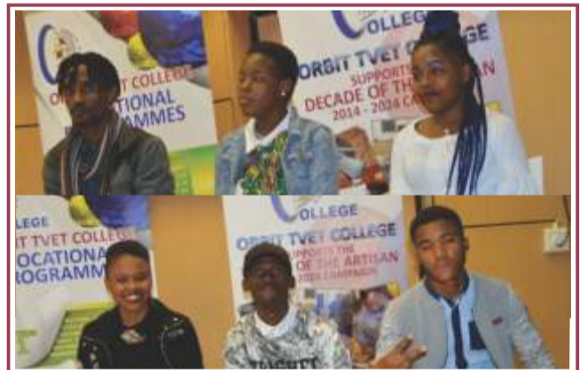
Participants of the Debate Competition