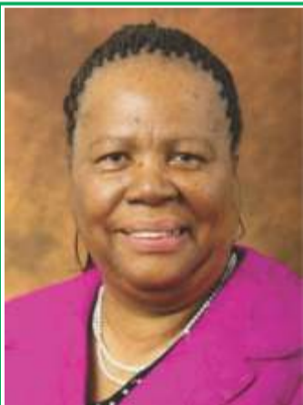
Minister of Higher Education & Training, Hon. Naledi Pandor. Ms Pandor, who was appointed on 1 March 2018, is not new to the portfolio; as she served as Minister of Education under former presidents Thabo Mbeki and Kgalema Motlanthe