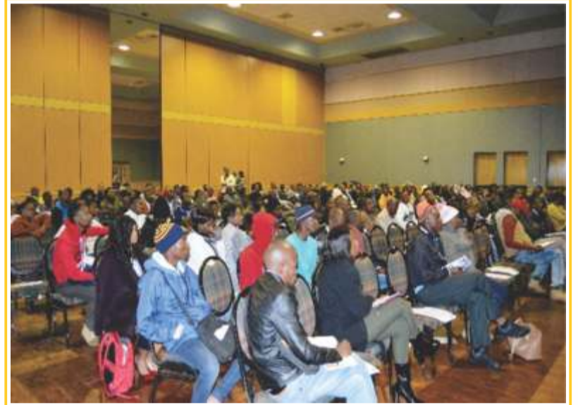
SMMEs came out in numbers to the Rustenburg Civic Centre, to find out more about the opportunities available to them as entrepreneurs of youth-owned businesses

The Centre for Entrepreneurship and Rapid Incubator at ORBIT College was among the key stakeholders invited to the event, being an establishment that offers generic business support services to SMMEs on a daily basis in and around the Rustenburg area.