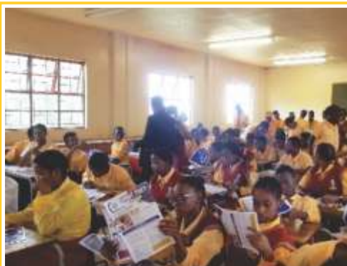
Grade 12 learners of Rakoko Secondary School in Mabeskraal Village divulging in College information material after presentation